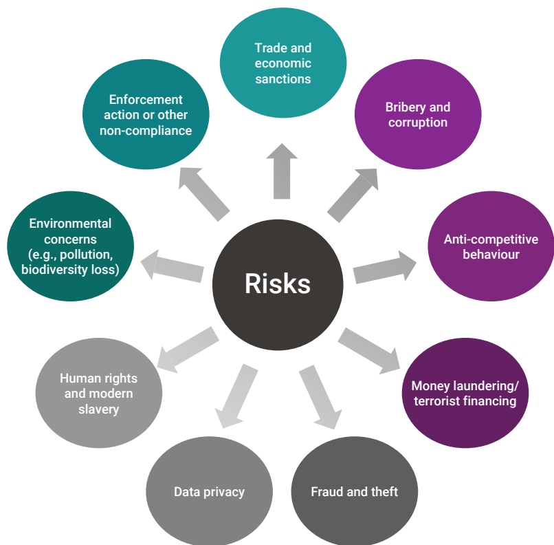
Figure 1: Compass Group Third Party Integrity Due Diligence Policy—Business integrity risks

The implementation of the TPIDD policy was supported by training for members of our procurement team so that they fully understand potential risks and the escalation steps required to address them. Moving forward, the TPIDD assessment and Sedex onboarding and review process will form the key components of Compass Group Canada's supplier risk assessment.