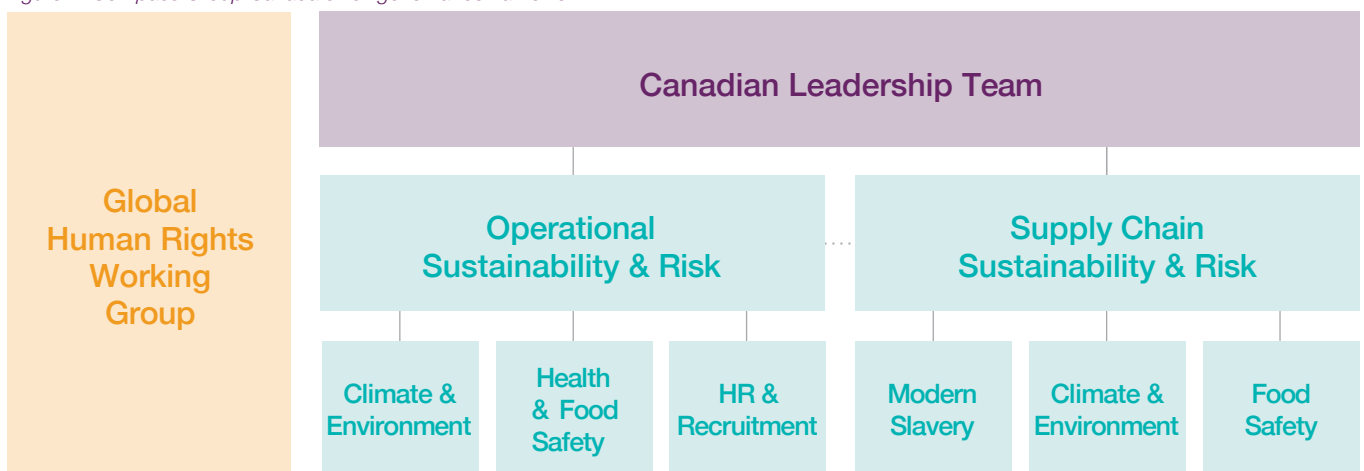
Figure 1: Compass Group Canada's risk governance framework

The following figure outlines our governance framework with respect to identifying and mitigating the risks associated with forced labour and child labour in our supply chain.